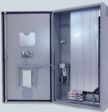
Wall Mount PowerAct Active Filter 125A: 65x36x14 (IN), 1615x914x355 (MM), 592 lbs