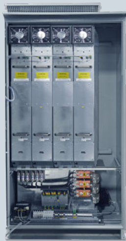
PowerAct Active Filter 500A: (Floor Mount), 90x40x25 (IN), 2286x1016x635 (MM), 1526 lbs