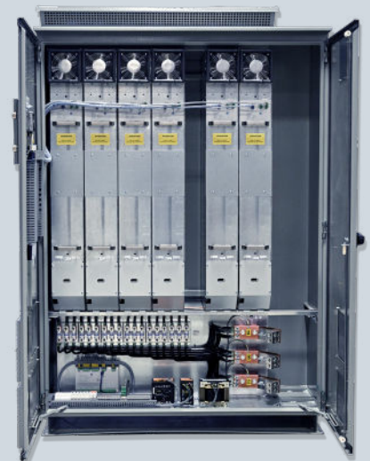
PowerAct Active Filter 750A: (Floor Mount) 90x60x25 (IN), 2286x1524x635 (MM), 2218 lbs