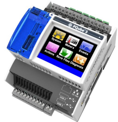
Figure 3: Powerside PQube 3e Power Analyzer module

Powerside customers have deployed 50,000+ PQube family of products in a wide range of global monitoring applications.