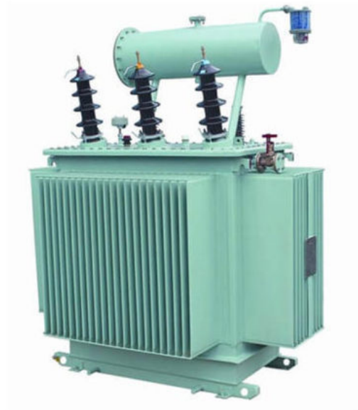
Figure 1: Typical distribution transformer

This white paper illustrates the new approach, leveraging the advanced power and sensor monitoring capabilities of Powerside's PQube 3e power analyzer.